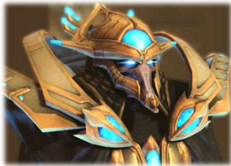
~Hierarch Artanis (above)

Special Ability (Protoss Psychic): Artanis is a powerful protoss psychic that can gain a Psi Level of up to 10, and can draw powers from the Telepathy, Telekinesis, Energy, Temporal, or Augmentation disciplines. The character also possesses Psionic Detection, Natural Mind Reading, an Instinctive Telepathic Link with other Aiur Protoss. Artanis draws his power from the Void, but can use it to replicate either the Khala or Void psionic power sources.