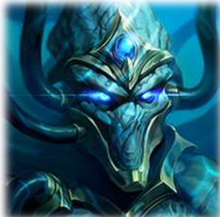
~Fenix inside his Dragoon (right)