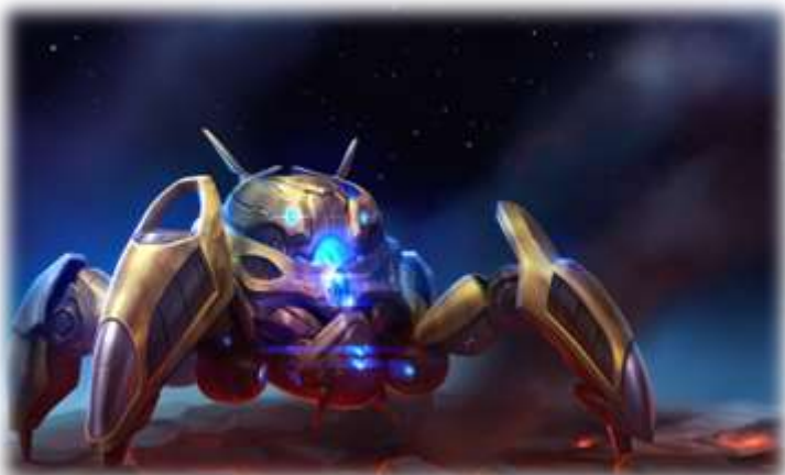
~Fenix's Dragoon (left)

Special Ability (Mental Discipline): Fenix never overloads psionic powers due to a poor die roll. When he boosts psionic powers, roll 1d20 + the amount of PL he is boosting. He only suffers a Critical crippling wound if the result is 16 or higher.