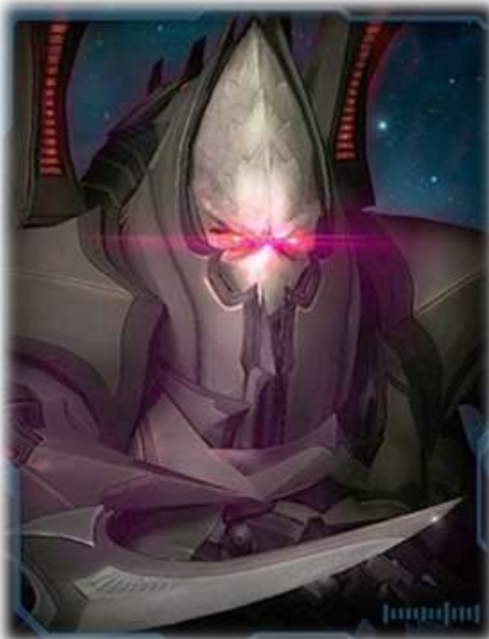
~Highlord Alarak (below)