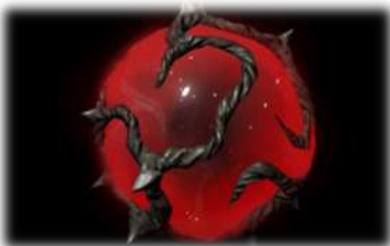
~Siphon Grenade (left)