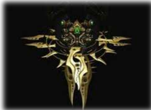
~Soul Cube in attack mode (right)