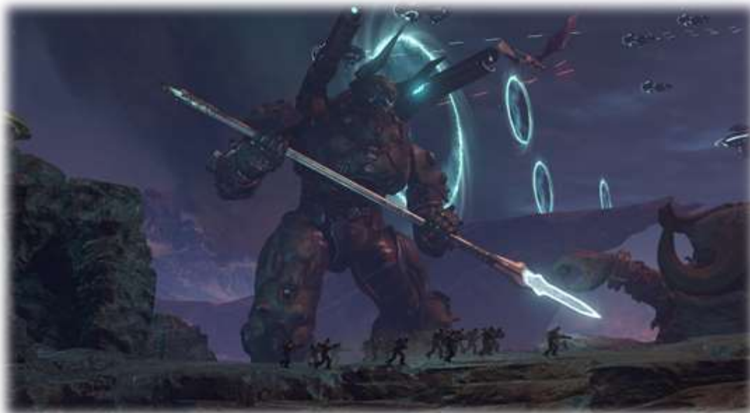
~Atlans facing off against Demon Titans in the middle of a massive battle

The mighty atlans were the legendary titan mechs of the night sentinels. When a great sentinel warrior was deployed in an atlan, they became a legion on themselves, capable of fighting hundreds or thousands of demons at once. Atlans were particularly prized as they were capable of fighting and killing a demon titan, which were normally unkillable by common weaponry. Many old atlans are still lying in damage and disrepair on Argent D'nur and hell. If these ancient colossi could be repaired, they would be a great boon to a night sentinel hero.