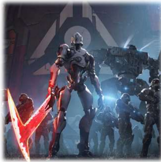
~The cybernetic Samuel Hayden leads the human ARC forces in their fight to protect humanity from extinction

Starting Gear: In addition to whatever gear they purchase with their background points, human characters begin gameplay with basic clothing, an equipment belt, and backpack.