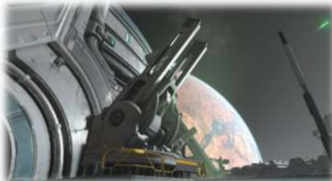
~Human Defensive Turret (top)

The defensive turret is a common plasma based defensive installment. Crewed by a single gunner, networks of these turrets can help defend a space station or military base from incredible incoming offense. These turrets have a wide variety of different designs, and different models of defensive turrets are used by the ARC, the UAC, the night sentinels, and the hell-born immorans.