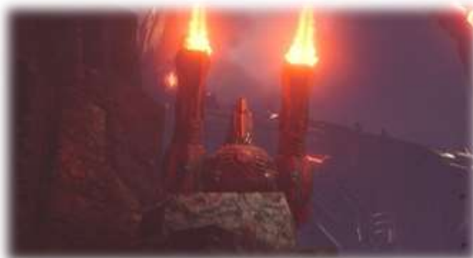
~Immoran Defensive Turret (bottom)